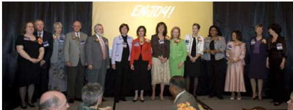
GVFHRA Presidents recognized for their contributions